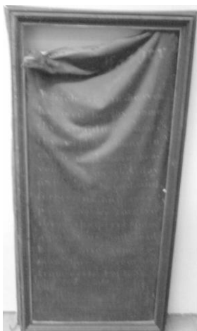
Front before treatment