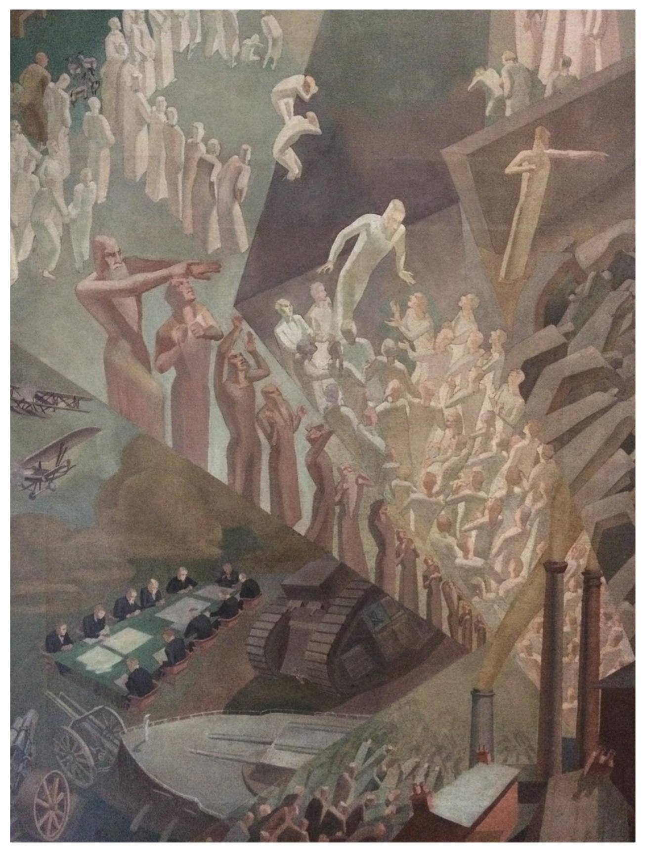
Allegory of War, the Last Judgement