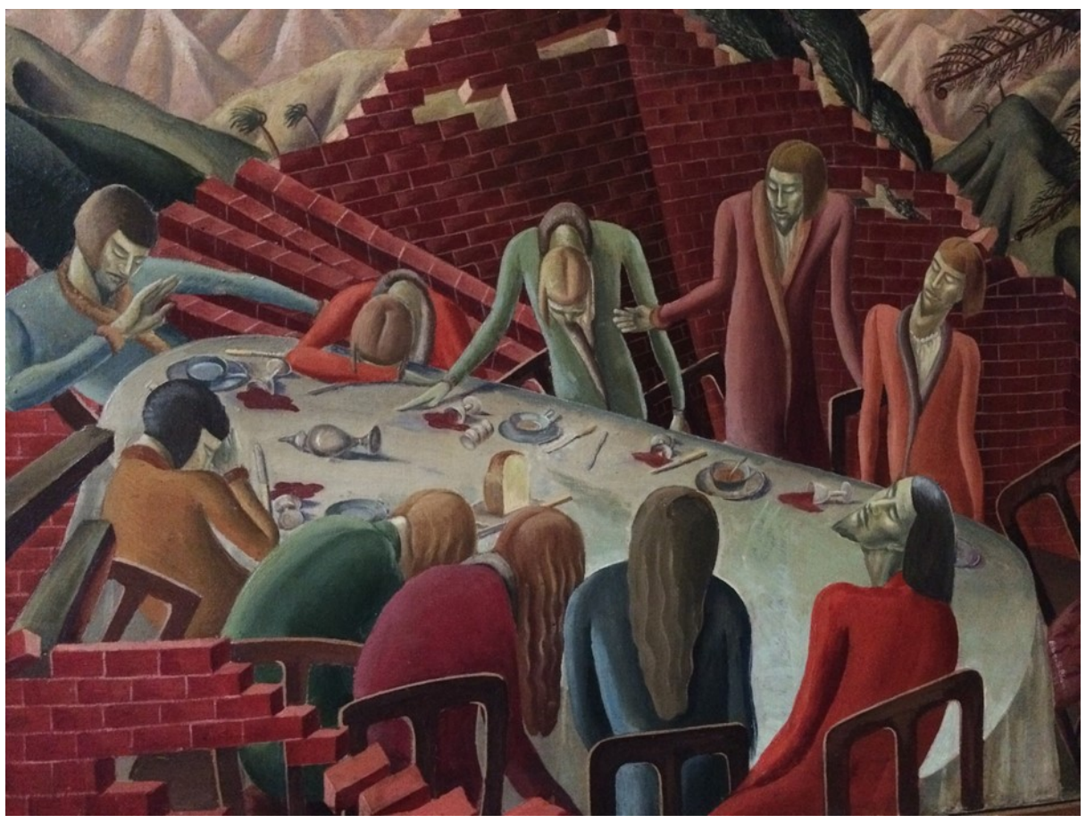
Scene from the Book of Job