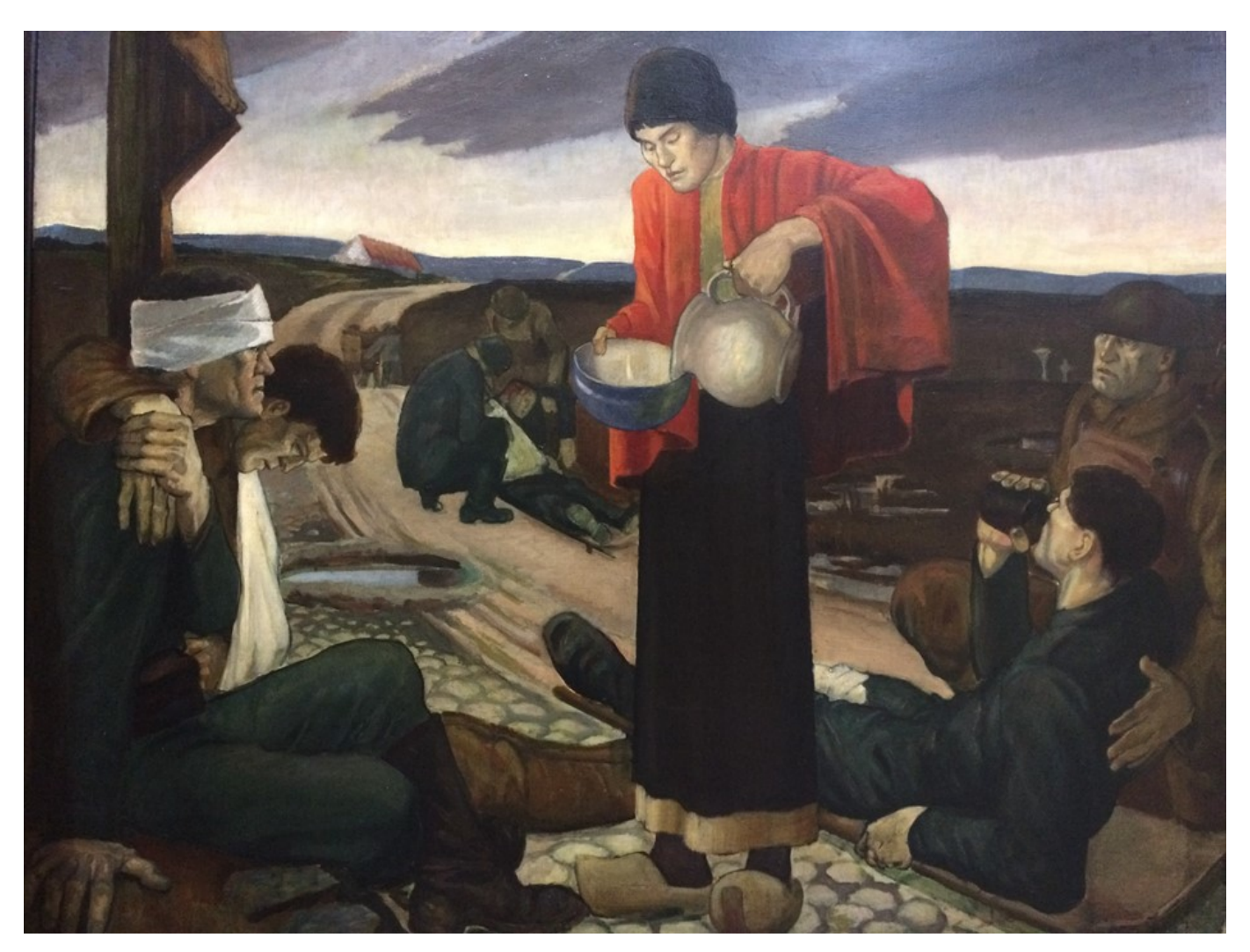
The Good Samaritan