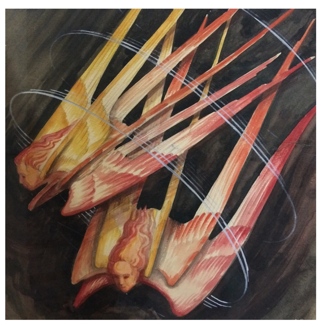
Design for Stained Glass Window